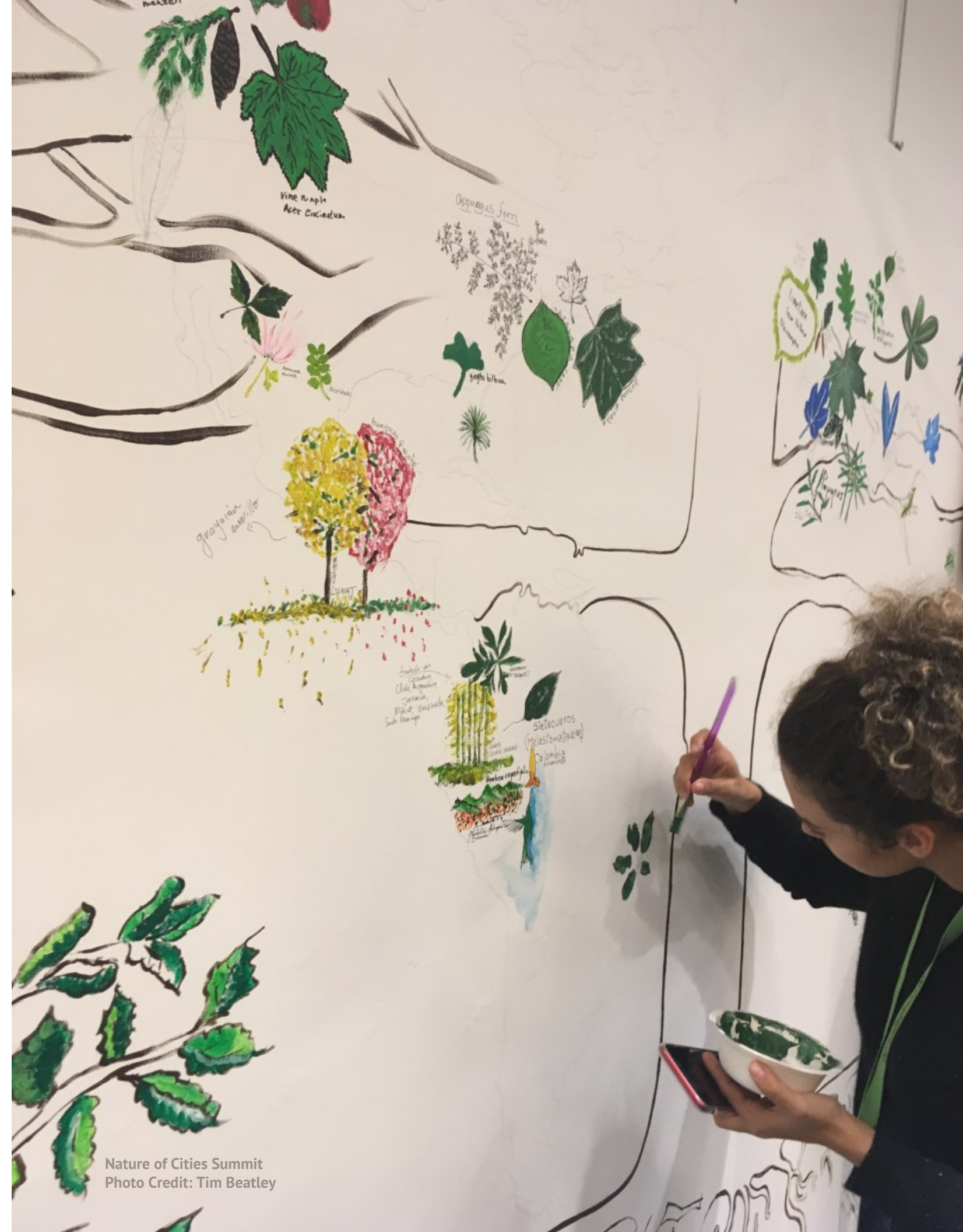
Nature of Cities Summit

Heather Stimmler (Feb. 4, 2019). Inexpensive Houseplants by Plantes Pour Tous . Secrets of Paris . http://www.secretsofparis.com/heathers-secret-blog/inexpensive-houseplants-by-plantes-pour-tous.html .