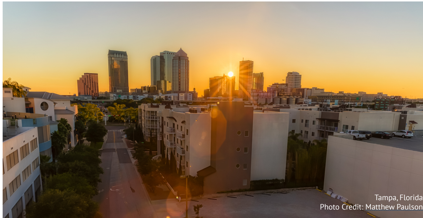
Tampa, Florida