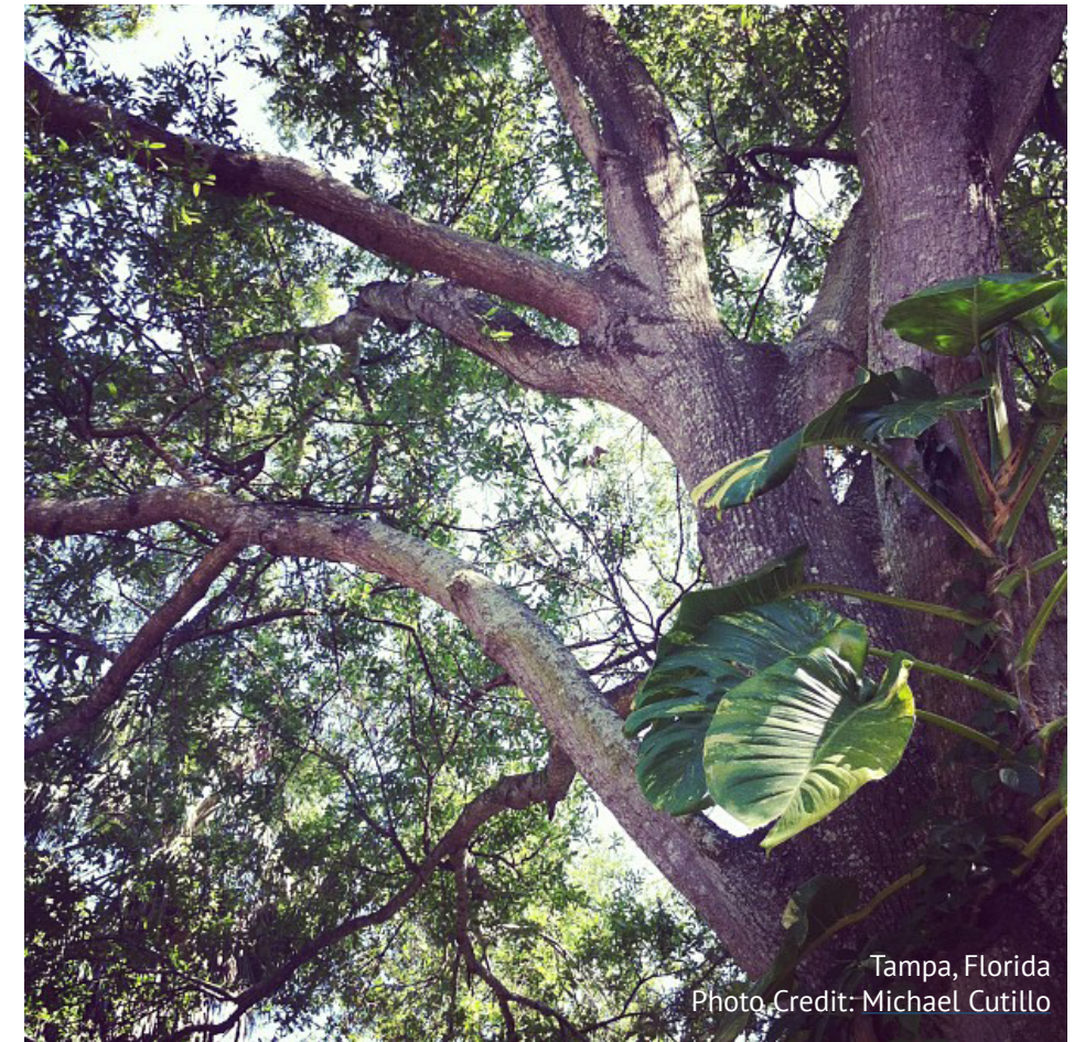
Tampa, Florida