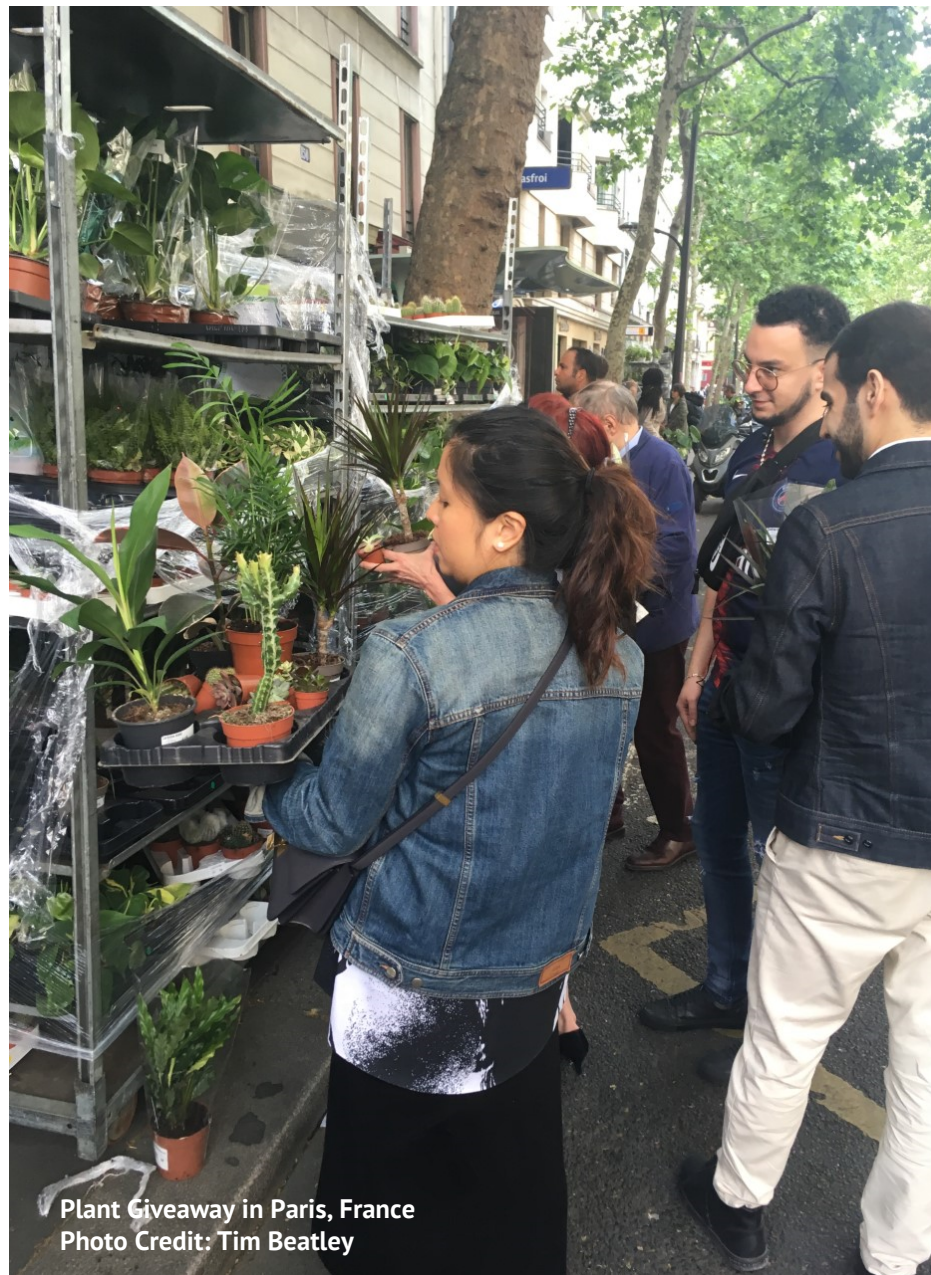
Plant Giveaway in Paris, France

I came away thinking to myself how a city might similarly create a plant give-away and how cost-effective it would be to invest in a few hundred (or a