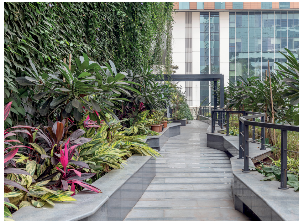
Photo on this page and opposite show the effect of landscaping less than a year after planting. Trees and greenery will grow markedly in the coming years

As the design progressed, the path up The Rock was further refined, guided continuously on the outside by broad planters containing bushes and grasses. At strategic moments resting places were introduced for walkers to pause and get a panoramic view of the campus. Pergolas were erected to mark these intermezzos and deep planters