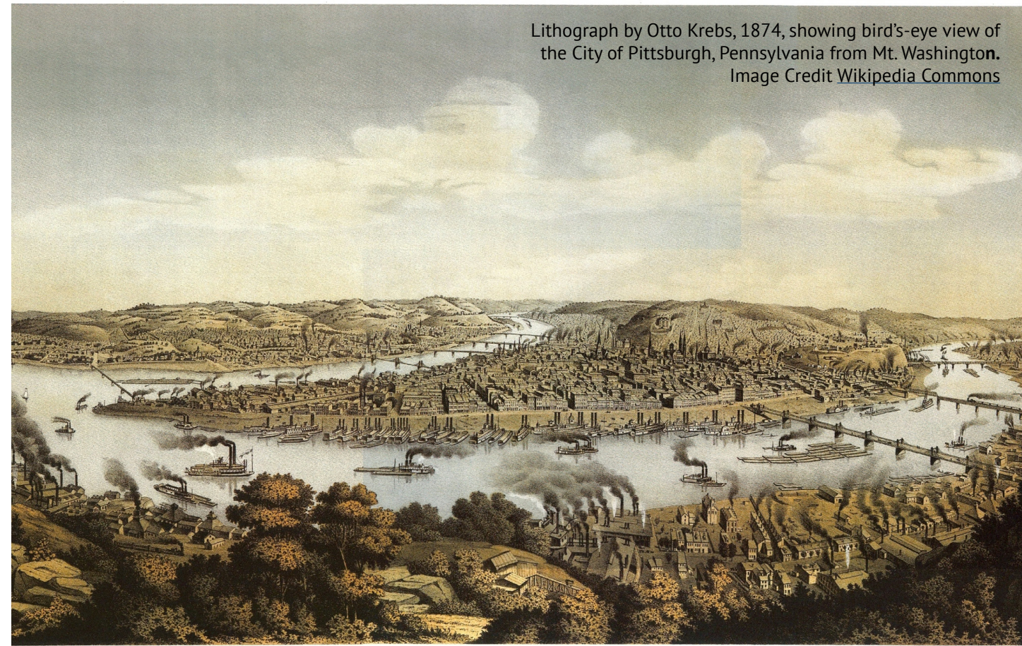
Lithograph by Otto Krebs, 1874, showing bird's-eye view of the City of Pittsburgh, Pennsylvania from Mt. Washington.