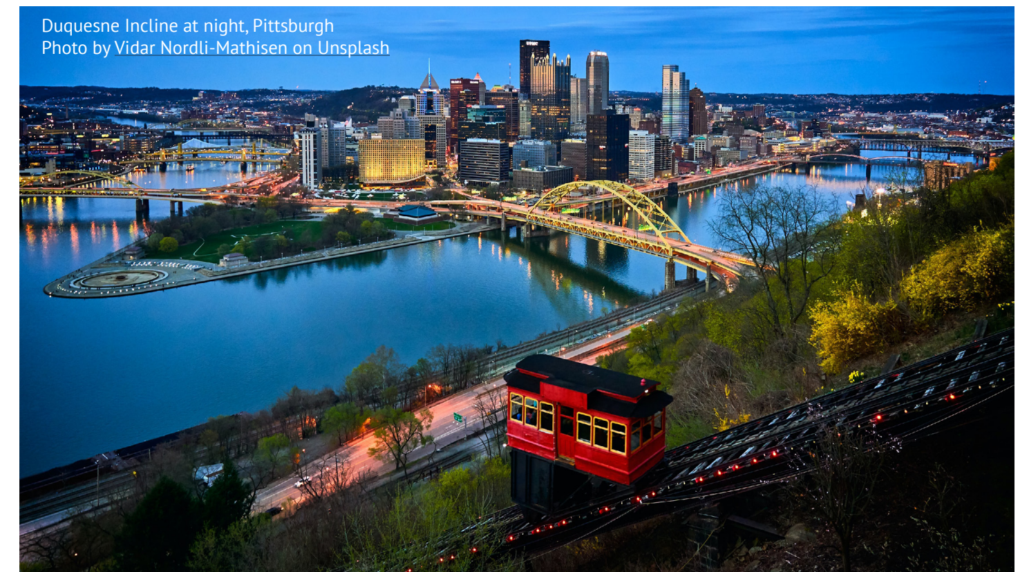
Duquesne Incline at night, Pittsburgh

My study contained four categories: Factual Basis; Public Education and Community Outreach; Policies, Strategies, and Regulations; and Incentives. Each category had a variety of indicators that were developed based on qualities of biophilic urbanism and green urbanism within U.S. post-industrial cities. A total of 27 indicators were