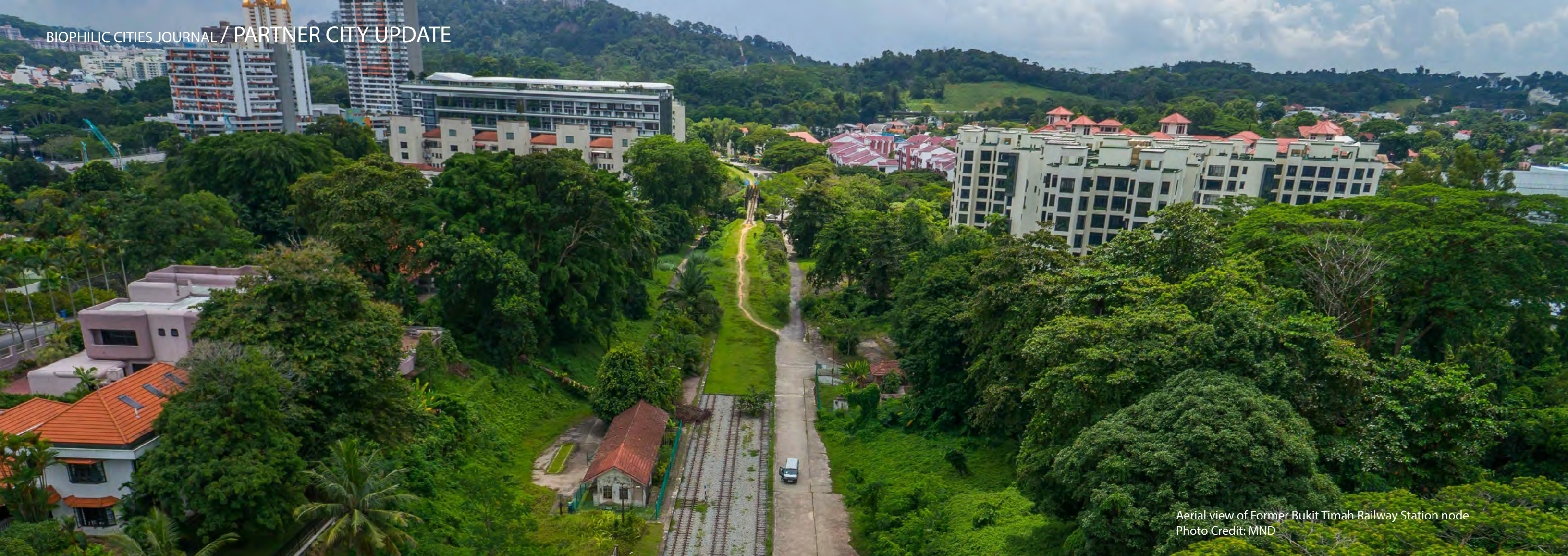
Aerial view of Former Bukit Timah Railway Station node