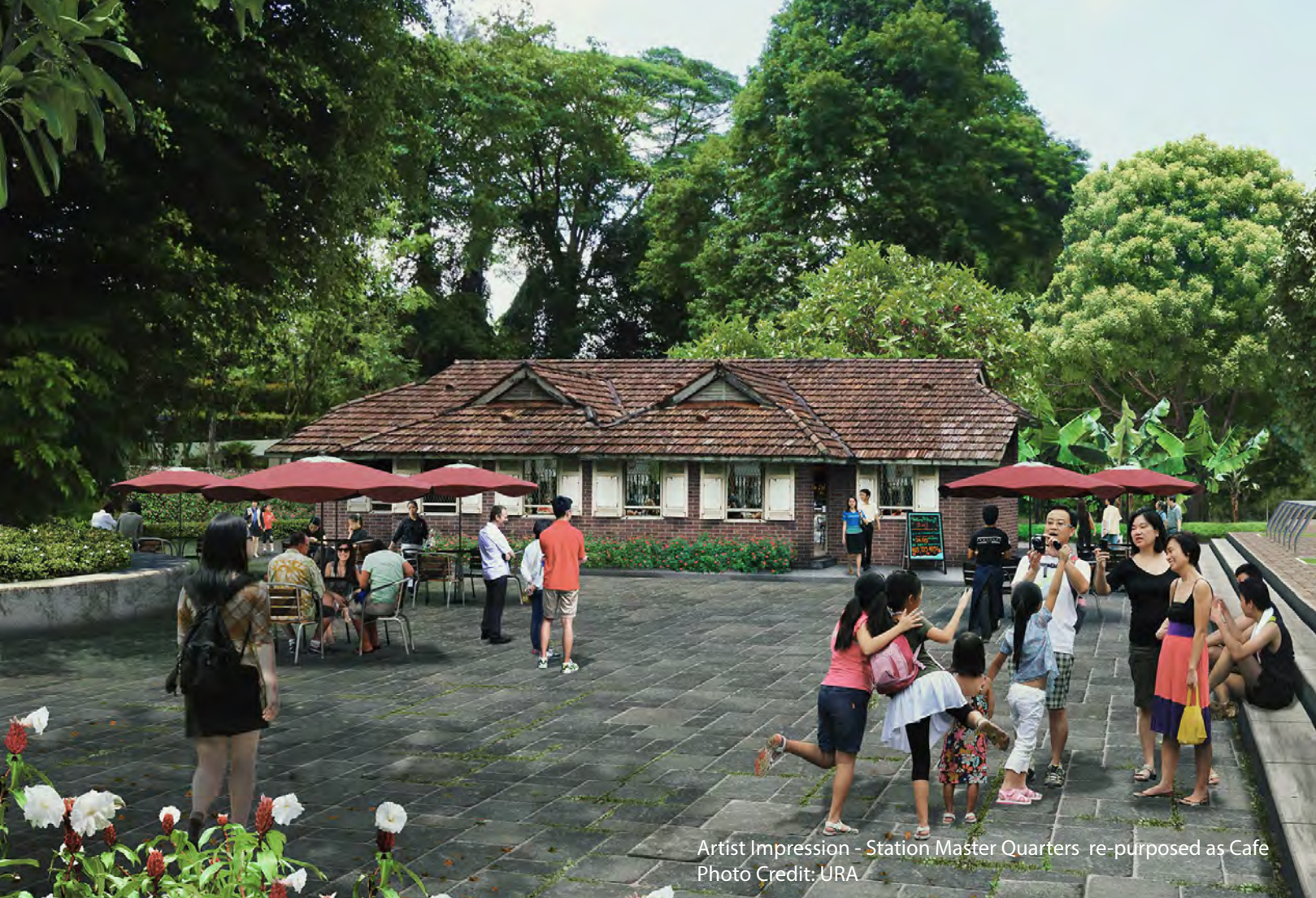
Artist Impression - Station Master Quarters re-purposed as Cafe Photo Credit: URA