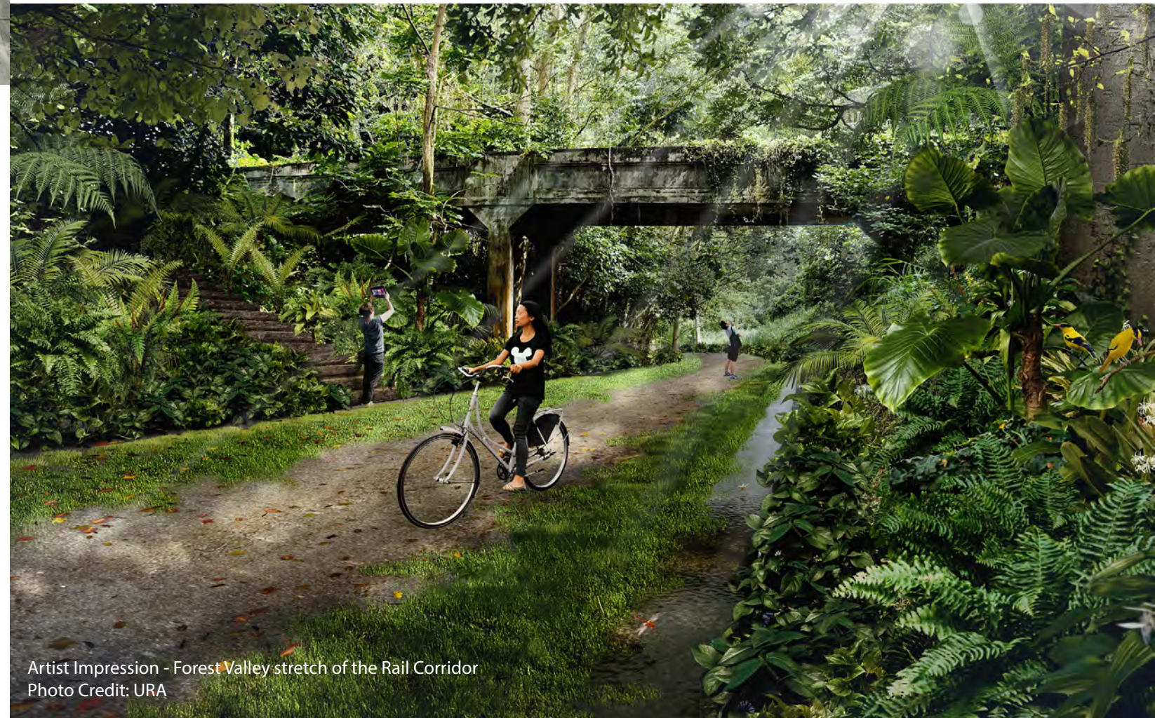
Artist Impression - Forest Valley stretch of the Rail Corridor

Urban Redevelopment Authority. Singapore. Rail Corridor. https://www.ura.gov.sg/ms/rail-corridor/overview .