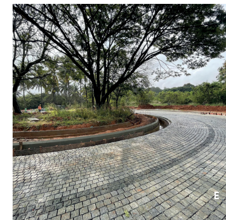
Images Corresponding to Map at Left