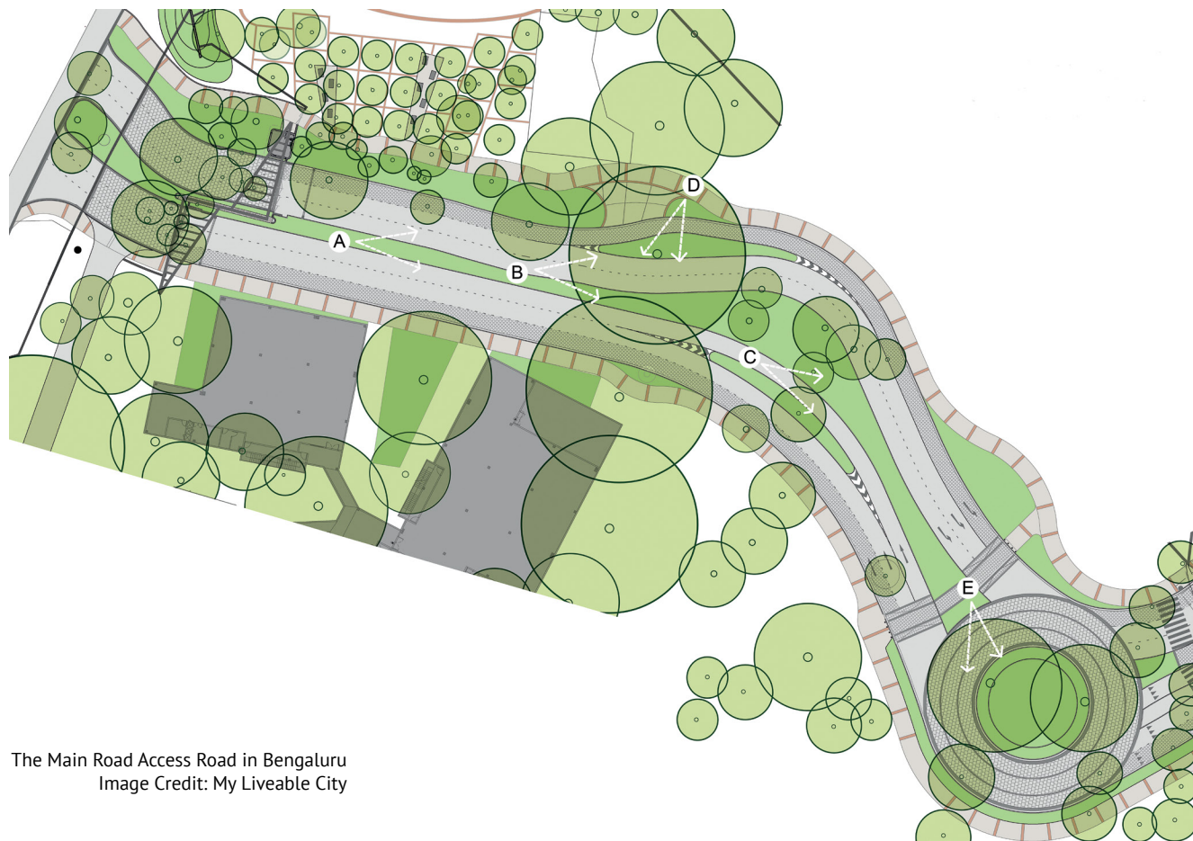
The Main Road Access Road in Bengaluru