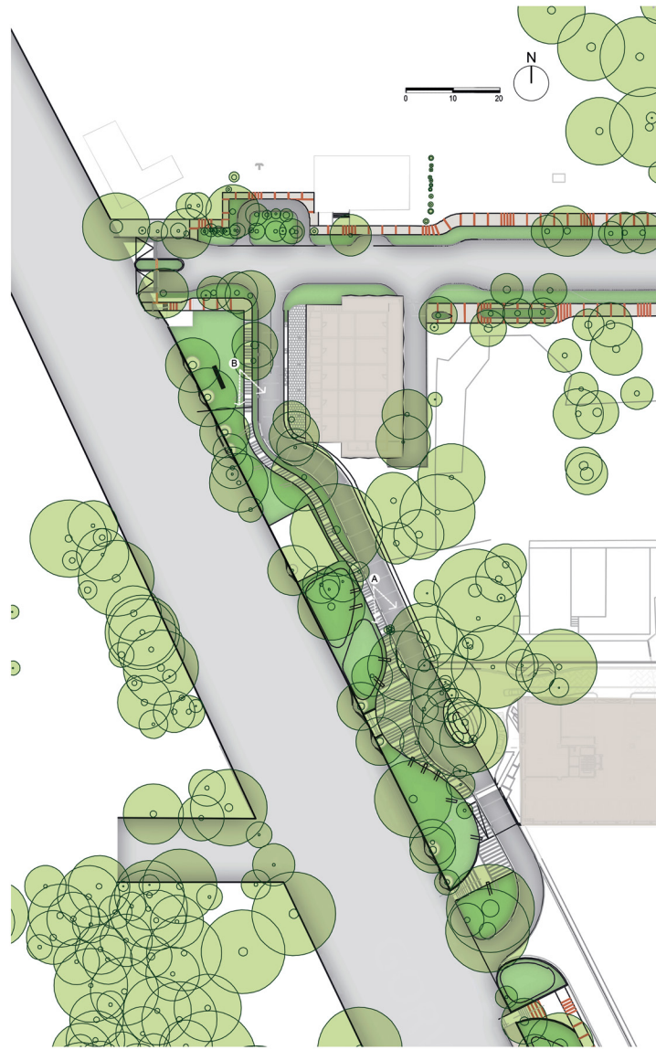
The Service Road in Vadodara

directions of traffic and also at places splitting the three lanes, more trees could be retained. The biggest hurdle in this design was a magnificent row of rain-trees nearly 25 metres tall, which lay perpendicular to the access road. For this reason, the access road lanes were split up and laid at different grades, so that the road could cut across the row of trees without having to cut a single tree.